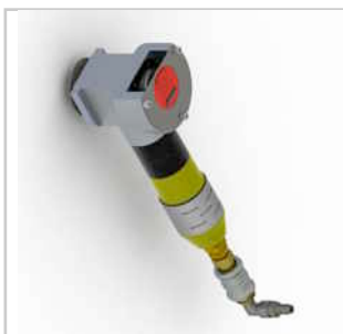
Motors: slow, fast, pneumatic