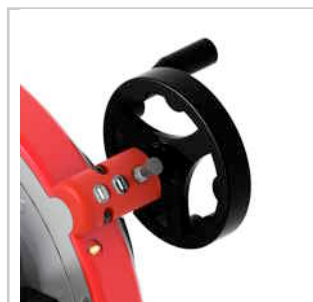
Rotation handle as standard : extends blade life and optimizes cutting quality