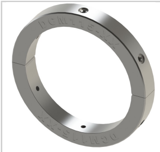
Stainless steel clamping collets One set per diameter