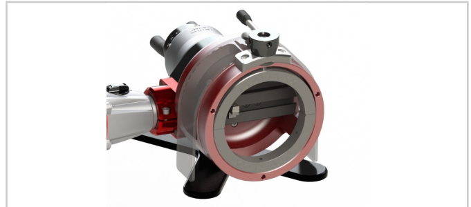
Easy clamping of the tube.