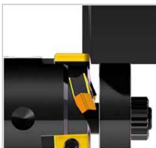
J bevel with profile guide roller