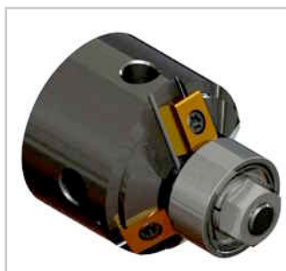
V bevel with profile guide roller