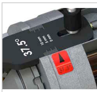
End stop adjustment : shows directly thickness of the tube for a V prep without land