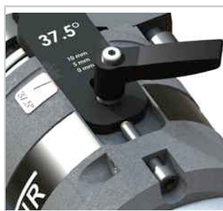
Fine adjustment : the screw allows a strong stop and a fine land adjustment