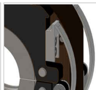
Adjustable spring- loaded system: to account for tube "out of round"