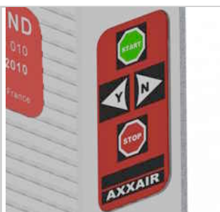
Remote control keypad