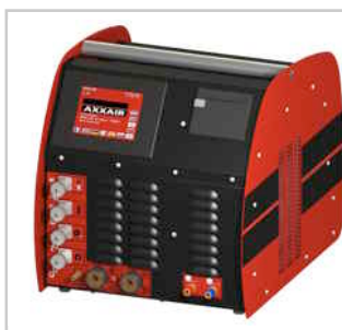
Driven by AXXAIR power source ( cf compatibility table )