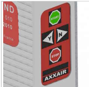
Remote control keypad