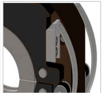
Adjustable spring- loaded system: to account for tube "out of round"