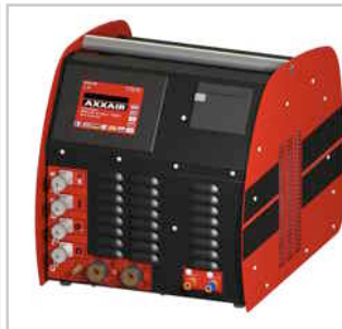
Driven by AXXAIR power source ( cf compatibility table )