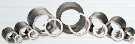
US & Foreign Patents Issued & Pending

SoluGap® Water Soluble Socket Weld Spacer Rings are made of EPA Approved Aquasol® Water Soluble Board. Dissolves completely and rapidly in most liquids. Unique tabs secure placement regardless of orientation. Compatible with any metal.