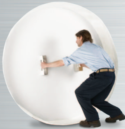
US & Foreign Patents Issued & Pending

EZ Purge® is a pre-formed, self-adhesive, water soluble purge dam that enables welders to save time on weld preparation as well as improve project timeliness. Since EZ Purge® is pre-formed; there is no need to measure, cut or construct a purge dam. Setup and installation time is completed in minutes, making EZ Purge® the most efficient and economical purge dam available.