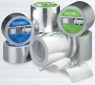
US & Foreign Patents Pending