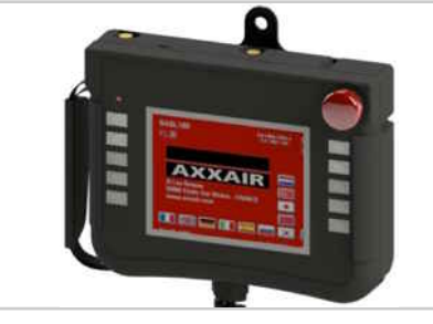
5.7" colour touch screen remote control. Secure, multi-lingual access