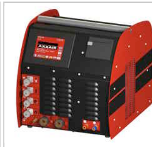
Driven by AXXAIR power source ( cf compatibility table )