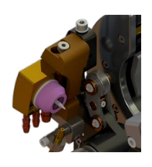
Mechanical profile guide: Constant arc voltage