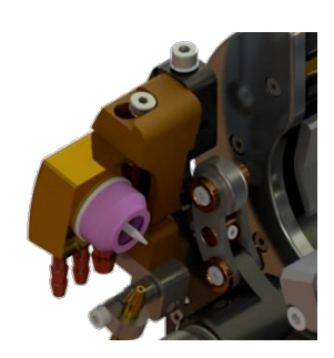
Mechanical profile guide: Constant arc voltage