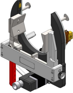
Symmetrical clamping / Straight motor