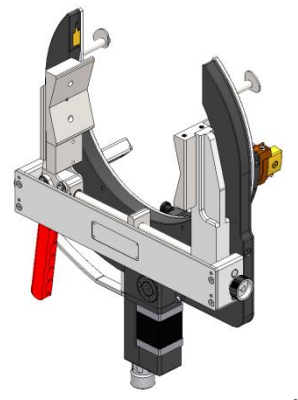
Symmetrical clamping / Angle transmission motor