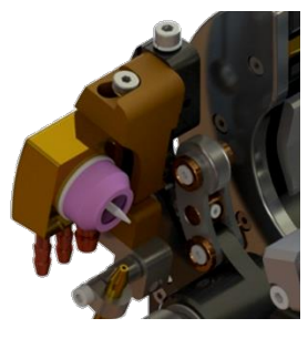
Mechanical profile guide: Constant arc voltage